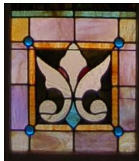
First Baptist Church

Senior Minister Minister of Christian Community Minister of Music Minister of Children, Families, and Outreach Minister of College Students Minister of Youth and Mission Organist and Music Associate Pianist